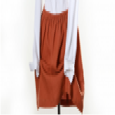
Linen Gathered Skirt